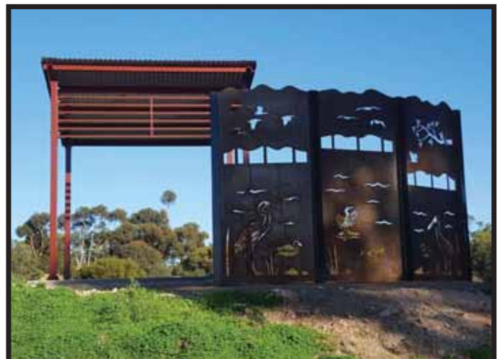
ABOVE: New Bird watching area.

Over 200 trees have recently been planted in this area and at this time of the year, it is well worth a visit. The Reserve is fully maintained by the Wellington Progress Association assisted by volunteers and generous grants.