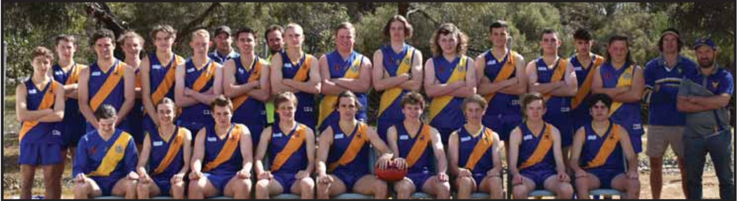
ABOVE: Under 17.5's Taillem Bend Football Team.

Thank you to everybody involved in both these teams and well done on this fantastic achievement.