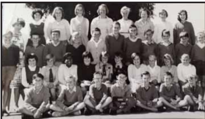
ABOVE: Taillem Bend Primary School, 1965.

A small Grade 6 Taillem Bend lunch reunion was held at the Taillem Bend Hotel on 4th September 2020. There are plans to create a class reunion in 2021.