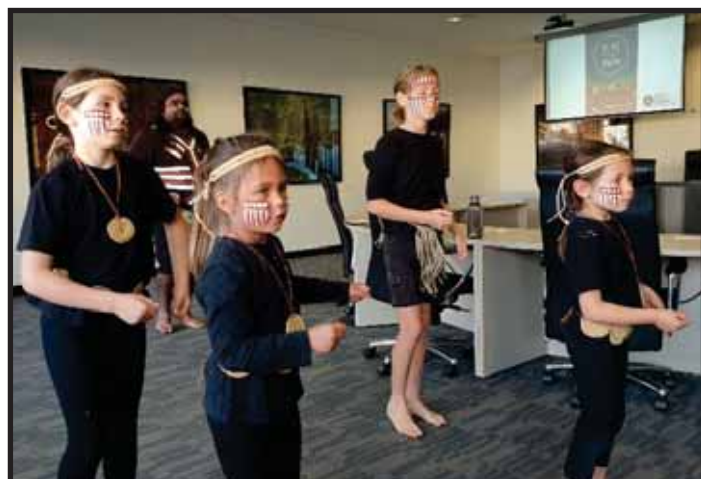
ABOVE: Dance troupe Rritjarukar (Willy Wagtails) performing during the 2019 NAIDOC week activities at the Coorong Civic Centre.

Friday 13th November – 10:00am at Tailem Bend Flag Raising Ceremony followed by Morning Tea