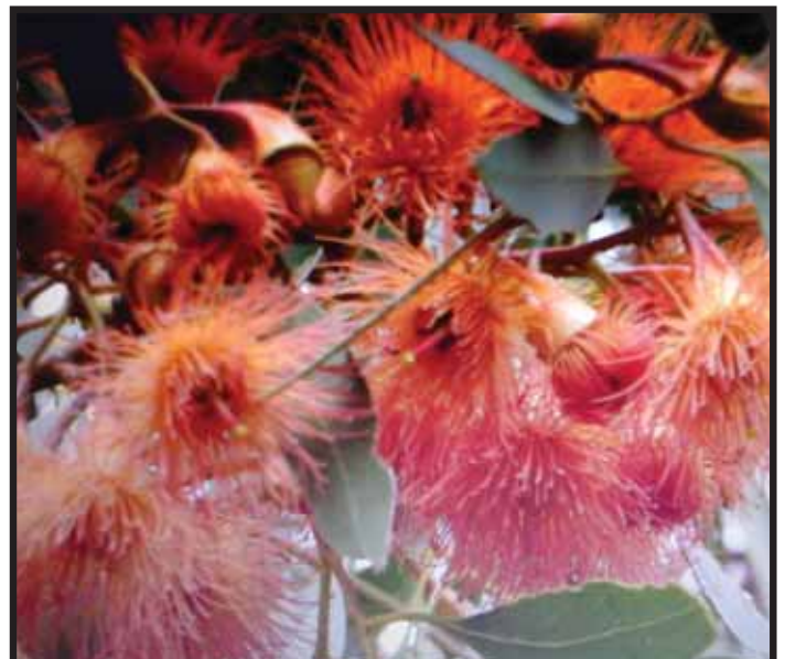
ABOVE: Eucalyptus Leucoxydon Orange colour.

At present you don't have to look up to see the great range of colour, the ground is covered in flowers under these trees, from cream to pink to red with the odd yellow and also a beautiful orange. Growing from seed does not always bring the parent colour.