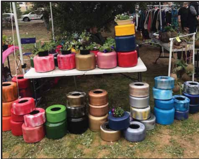
ABOVE: Reused Go Kart tyres at 'Just Potty' in Tailem Bend.

'Just Potty' will open on Saturdays and Sundays for the first three weekends of December 2020.