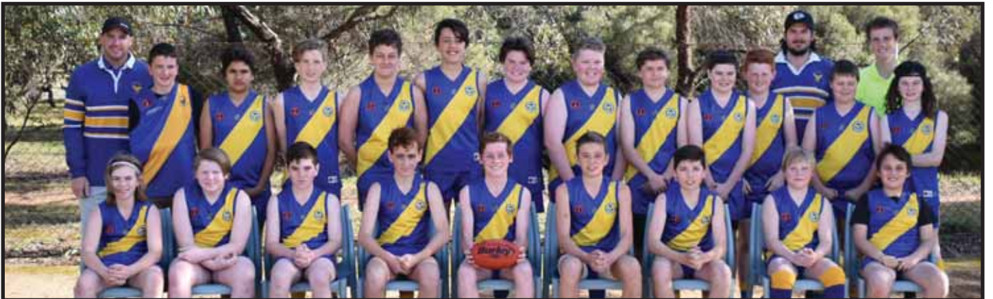
ABOVE: Under 13's Taillem Bend Football Team.