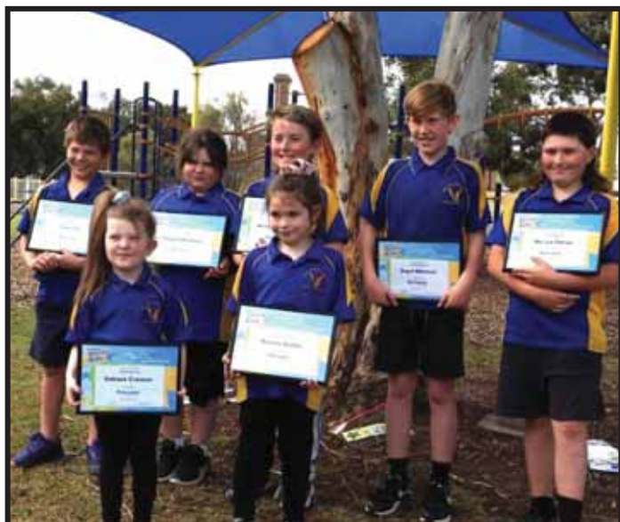
ABOVE: Kiwani Award Winners!

Congratulations to the Under 17.5's and the Under 13's Tailem Bend Eagles footballers who showed great grit and commitment to win their grand finals this year. This striving and success instils so much passion and pride in our town. Through experiencing the fundamentals of football, these boys also learn life skills which will take them beyond what happens on the football field. They are learning about discipline, team work, leadership and respect whilst having fun and making memories that will last a lifetime. Thank you to the Coaches, Committee and all the Volunteers who give countless hours each week, month and year. Your contributions make our club the success that it is. Well done Eagles! Story Page 30