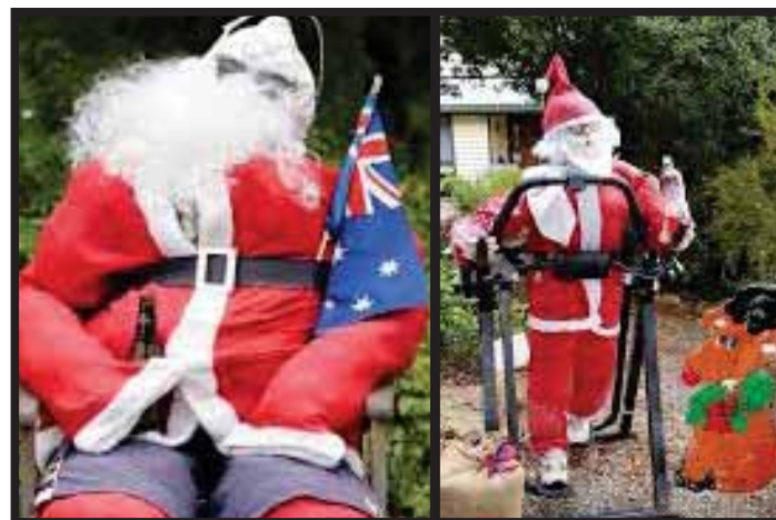
ABOVE: Some examples of posing santas. Remember though, you can pose any Christmas character its entirely up to you. But you have to be in it to win it!

Although we cancelled the cabaret we still have a raffle available at $2 per ticket . The prizes are simply amazing and well worth your gold coin. Look for committee members set up around town who will sell you as many tickets as you like. All funds raised will go towards a bigger better parade 2021.